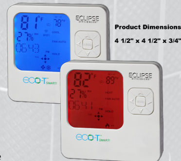
Product Dimensions 4 1/2" x 4 1/2" x 3/4"